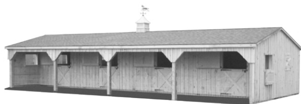
A 12' x 24' run-in shed with cupola.